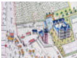
Alfter Castle with the adjacent convent of St Anne of the Augustinian Sisters on a map of 1793

As a piano teacher for the nobility at court, Beethoven often played in the castles and palaces of the region.