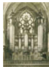
The organ Beethoven played in St. Remigius Church

The church in which the 10-year-old Beethoven played the organ for the early mass and the site of his baptismal font since 1806.