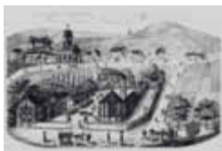
The Roisdorf spring, 1850, the nearby Alfter Castle can be seen in the background, left

Family excursions to Roisdorf Spring introduced Beethoven to spa water at an early age.