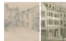
Bonngasse 20, around 1827, and the rear building before its restoration in 1889

The rear building of the house at Bonngasse 20, the house where Ludwig van Beethoven was born in December 1770.